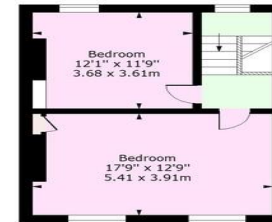
Second Floor Floor Area 453 Sq Ft - 42.08 Sq M

For Illustration Purposes Only - Not To Scale www.lpaaplus.com